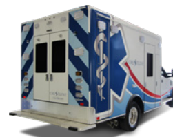
The all aluminum underbody bumper protects the module in low impact collisions.