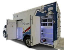
The CCL 150 offers 51.9 cu. ft. of exterior storage space.