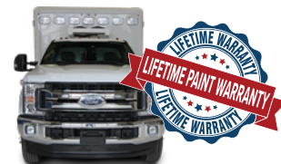
CrestCoat is a durable and cost effective corrosion prevention solution backed by a Limited Lifetime Paint Warranty.