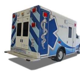
The all aluminum underbody bumper protects the module in low impact collisions.