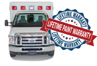
CrestCoat is a durable and cost effective corrosion prevention solution backed by a Limited Lifetime Paint Warranty.