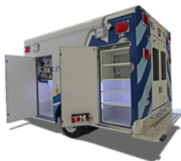
The CCL 150 offers 50.8 cu. ft. of exterior storage space.